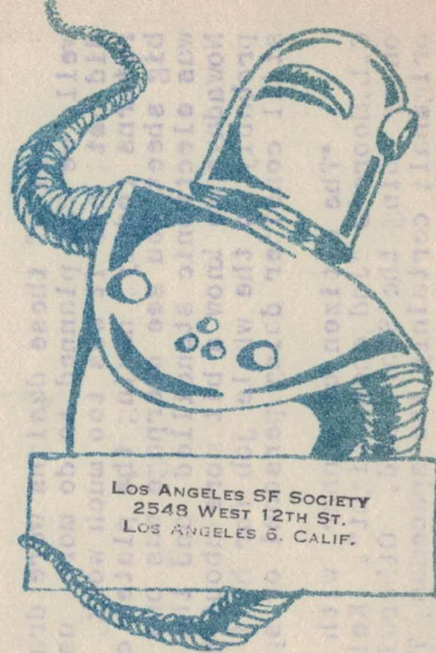
LOS ANGELES SF SOCIETY 2548 WEST 12TH ST. LOS ANGELES 6, CALIF.